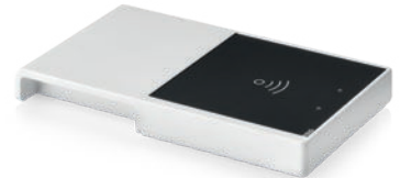
ID CPR30pro / ID CPR30pro SAM